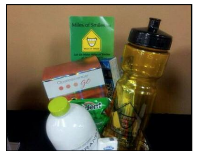
Miles of Smiles donated this dental goody basket to a fundraiser for Artstarts, a non-profit group for children. Let us know if you are having an event.